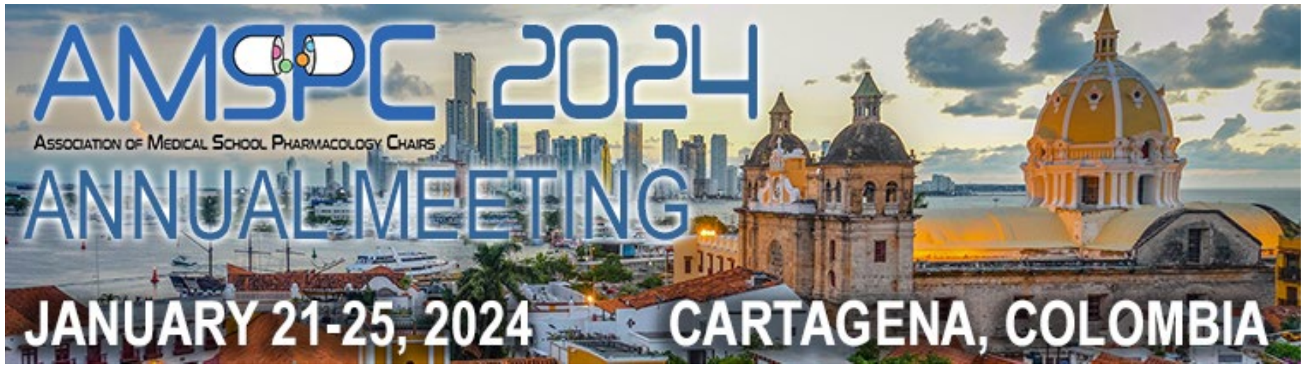
EXHIBIT ❖ SPONSOR ❖ ADVERTISE ❖ SUPPORT